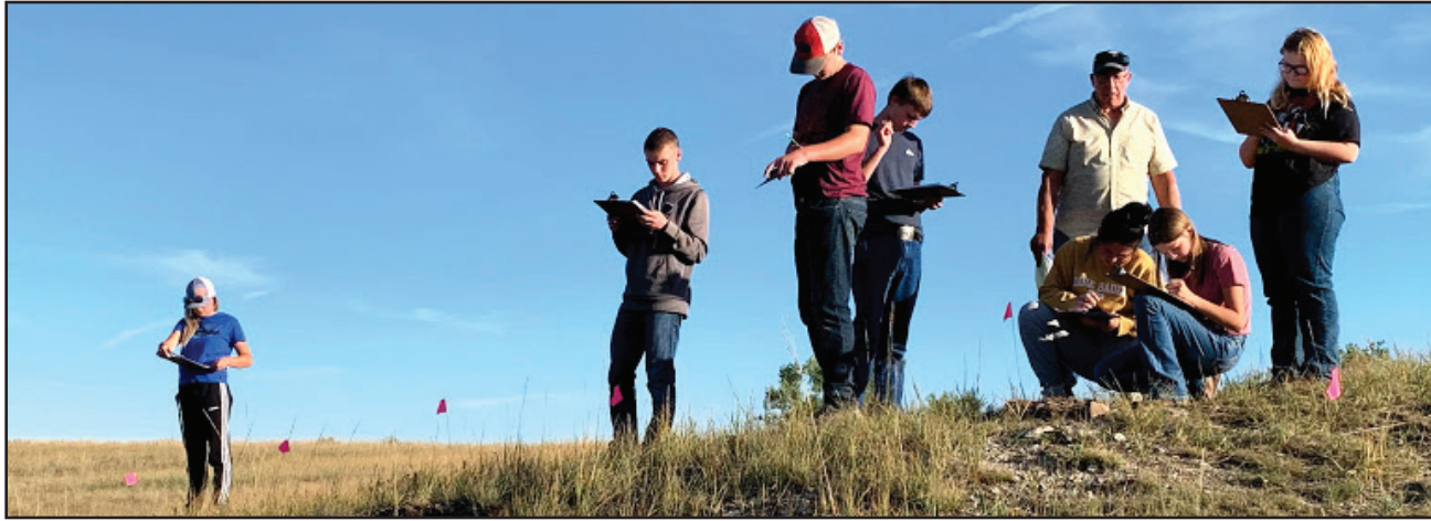
Range Team - The FFA Range Management Team learns how to identify range plants found in North Dakota. They also evaluate the site for use by livestock and grouse and make recommendations on how to improve the site.

FFA Alumni Crops Judging Contest, FFA Alumni Livestock Judging Contest, Foster County Fair, FFA Alumni Crop Show, FFA Alumni Ag. Sales Contest, High School Blood Drive, Flock-A-Yard for Cancer patients.