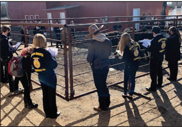
Judging Contest - Each March, the Carrington FFA Alumni hosts and Ag. Sales, Agronomy and Livestock Judging contest. The event is attended by over 400 FFA members from across North Dakota.