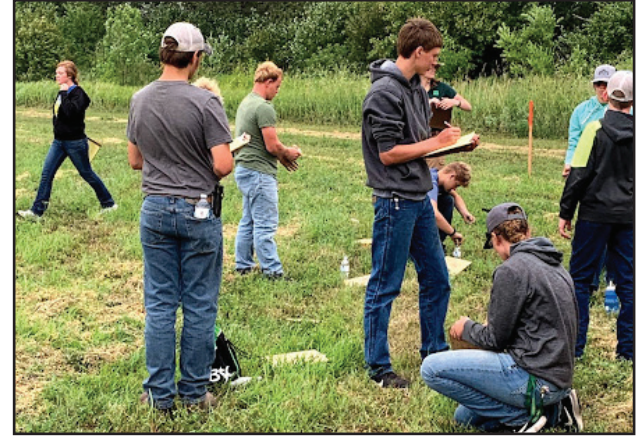
Land Judging - FFA members have many opportunities to compete in a variety of events. The land judging contest requires them to evaluate the texture, slope, and depth of the soil and make recommendations for how to best utilize the class of soil.

FFA members have opportunities to take part in leadership conferences, international travel and conventions. With more than 300 careers in the agriculture industry, they are our future chemists, veterinarians, politicians, horticulturalists, ranchers and teachers.