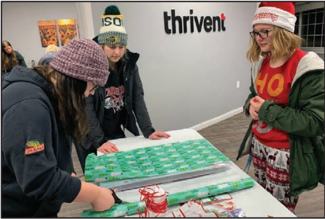
Wrapping Gifts - The last line of the FFA Motto is "Living to Serve". FFA members assisted Thrivent with wrapping Christmas presents that were given to kids in the community.