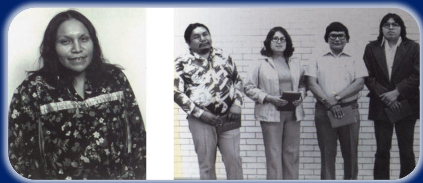
1977 First Graduates